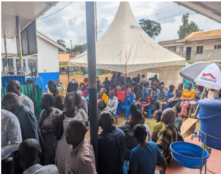
Eye patients at Nsambya Police H/C IV