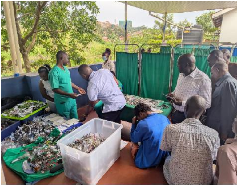
Dispensing of glasses